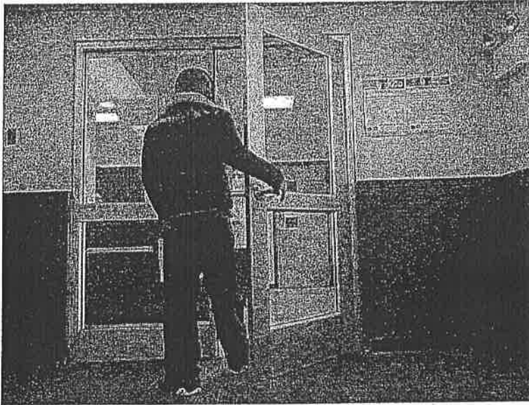
A visitor to Shortlidge Elementary School enters a secured reception area before being permitted to enter the main part to the school.

Other security upgrades, like increasing the number of school resource officers the district has and hiring retired police officers to serve as school constables, were also paid for with tax revenue. A recent referendum, approved in February 2015, included the costs.