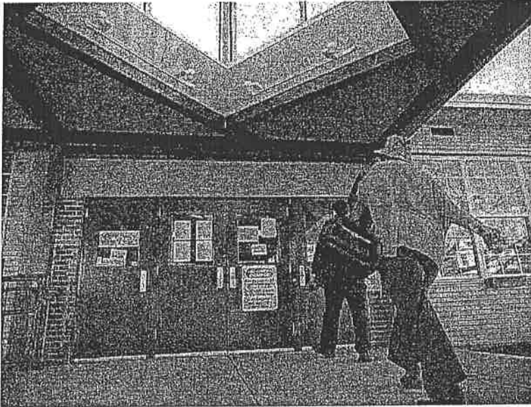
Visitors to Shortlidge Elementary School approach a locked door before being permitted entrance to the school's reception area.